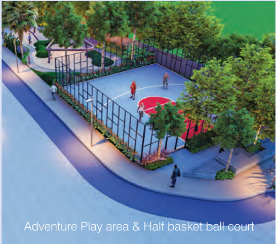
Adventure Play area & Half basket ball court