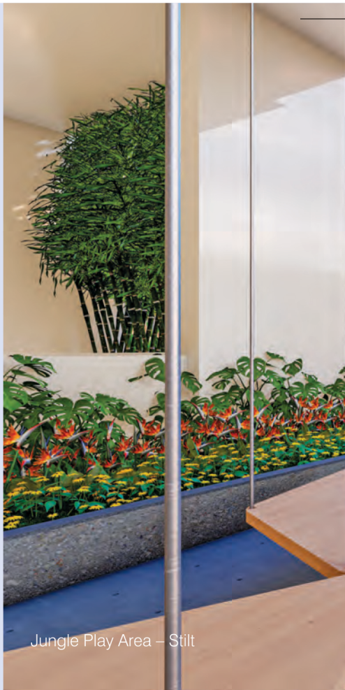
Jungle Play Area – Stilt