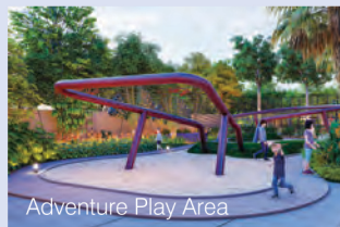
Adventure Play Area