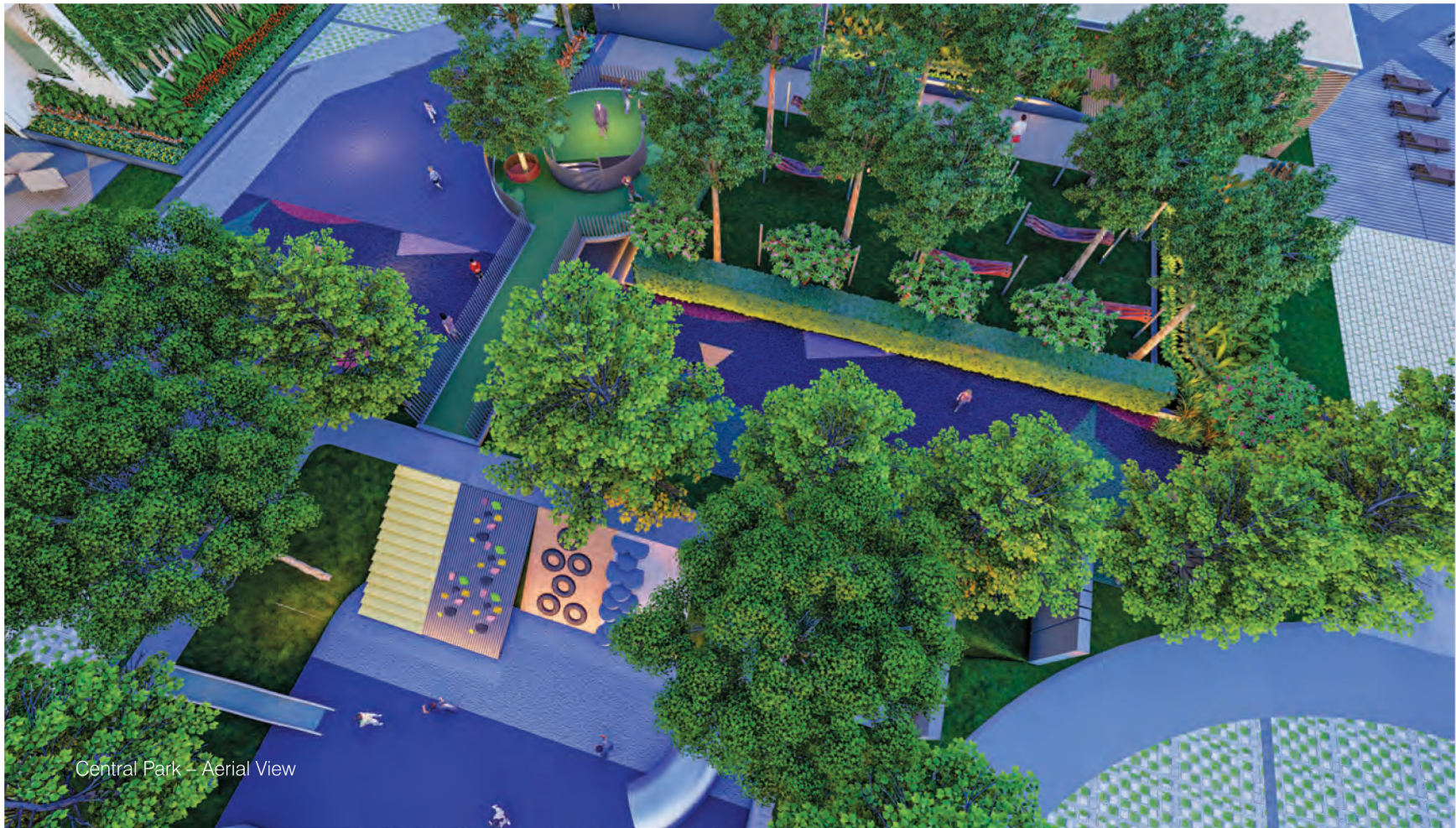
Central Park – Aerial View