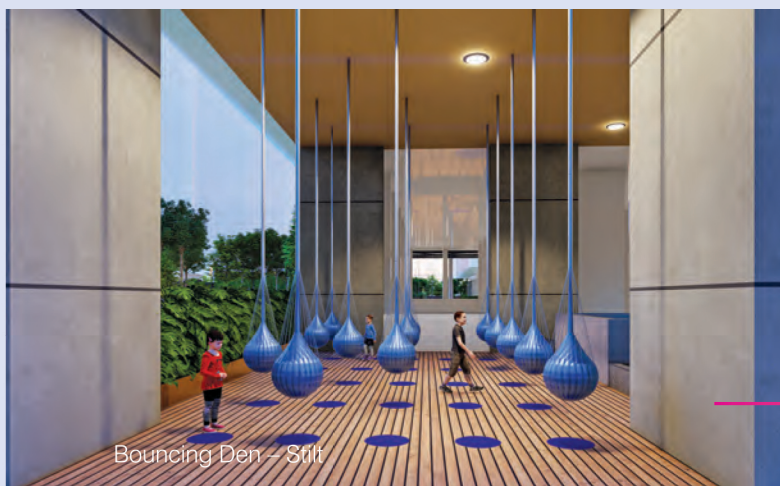
Bouncing Den - Stilt