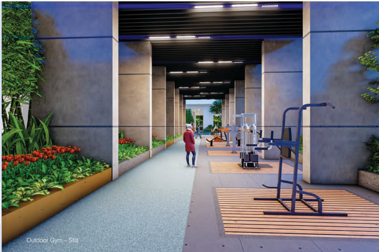
Outdoor Gym – Stilt