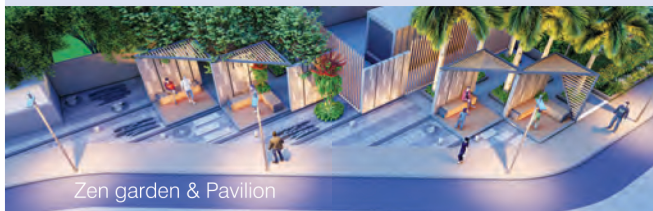
Zen garden & Pavilion